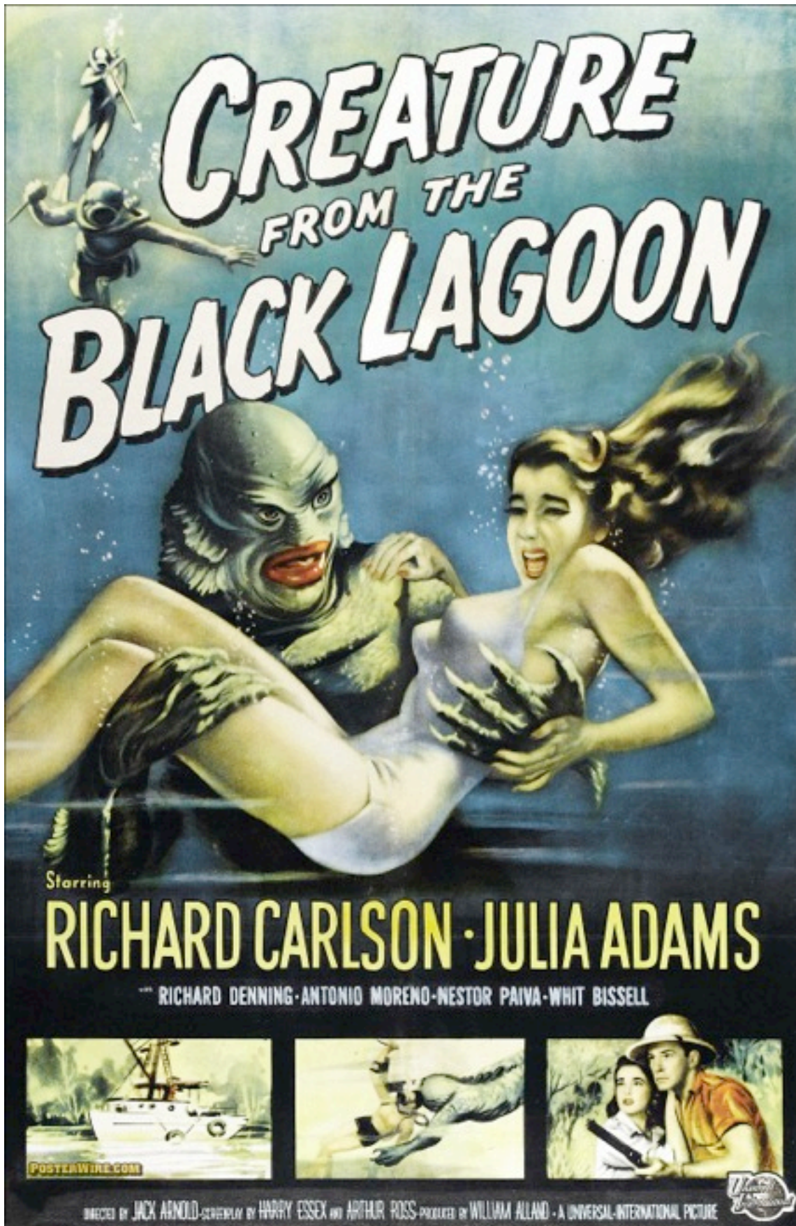
The Creature from the Black Lagoon , director Jack Arnold, 1954.